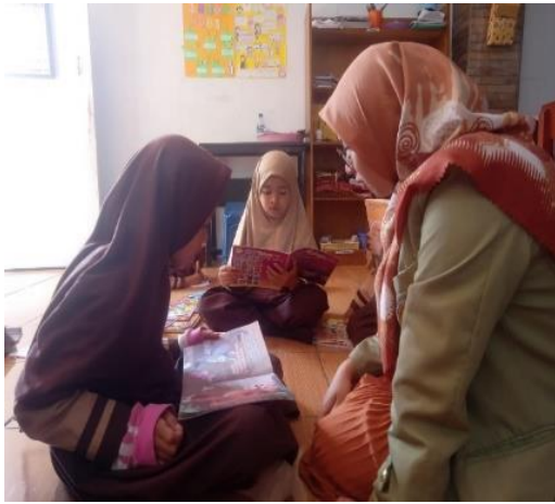
Figure 7 MMCI implementation

In the MMCI program, teachers are essential in the implementation process. Teachers, as motivators, motivate and encourage students to read books. Teachers, as facilitators, must also monitor the implementation of MMCI in the classroom. Besides that, teachers also make particular MMCI schedules according to the conditions and needs of students, check the progress of reading students, and report to the person in charge the data results from the reading cards written by students.