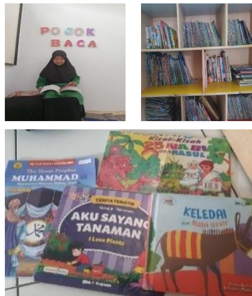
Figure 3 reading corner

In the image are exciting storybooks with images, and teaching materials such as storybooks, especially