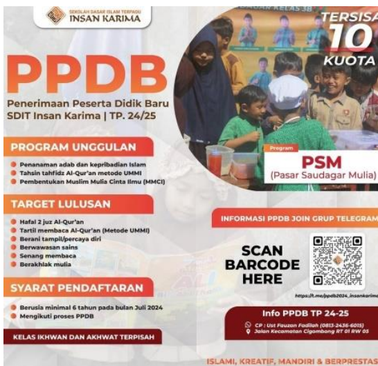
Figure 2 Flyer MMCI

MMCI implements a reading corner with various types of books.