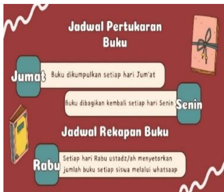
Figure 4 Book exchange schedule

The reading corner has a book exchange schedule so that all students can read the books provided by the school.