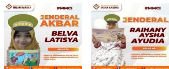
Figure 6 of the power of MMCI