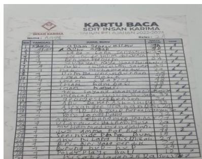
Figure 5 MMCI read card

The school also has a unique implementation method: it makes reading cards that students will fill in when they finish reading. Students will write down the book's title, the number of pages, and the number of books they have read. It will make it easier for the school to monitor students' reading activities.