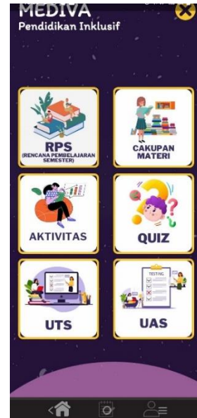
Figure 1. MEDIVA Inclusive Education

The development stage is a very important stage in development research, researchers must prepare assessment tools according to the theory studies that have been collected during definition and design activities. At the development stage, an initial draft will be produced which will then go through an expert appraisal process and carry out development trials, specifically trials of development results will be carried out using limited class trials and field trials. The initial appearance of the application is as shown in Figure 1.